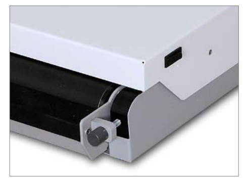
The integrated edge folding unit is adjustable for different cover board thicknesses.