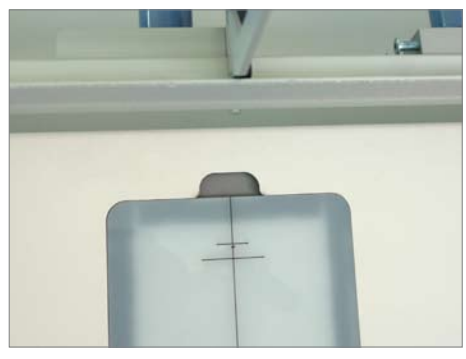
Registration marks for thicker and thinner materials offer you more versatility in applications.

Product information as of February 2009 and is subject to change without notice.