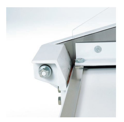
SOLID BLADE MOUNTING BRACKET

For efficient and easy cutting: Standard paper sizes from A6 to A3, American sizes (letter, legal, ledger size) and various angle indications printed on the table.