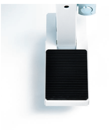
FOOT PEDAL CLAMPING The most effective foot pedal clamping system of this model is integrated into the stand.

The front gauge with integrated narrow strip cutting device is positioned via a calibrated rotary knob. A fold-away extension table supports the material to be cut, especially useful when trimming large formats.