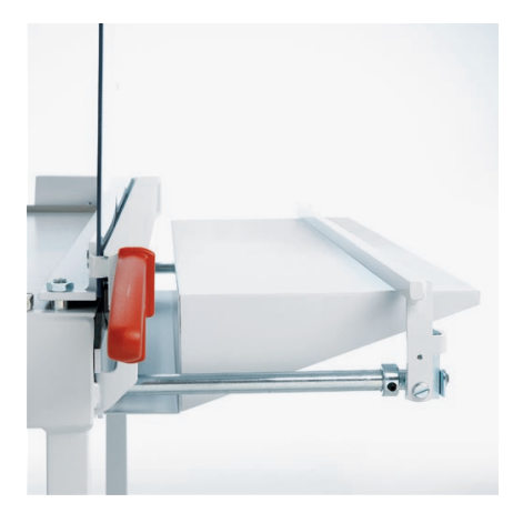
FRONT GAUGE AND SIDE TABLE

The front gauge with integrated narrow strip cutting device is positioned via a calibrated rotary knob. A fold-away extension table supports the material to be cut, especially useful when trimming large formats.