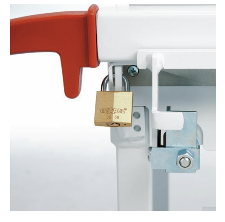
BLADE LOCKING DEVICE

Sturdy design: Cast aluminium blade mounting bracket with double pivot bearings for the blade axle guarantees highly accurate rectangular cuts.