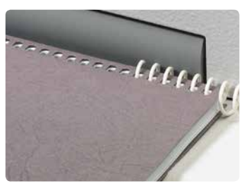
The simple to use rubber roller threads the coil through the document quickly and effectively.