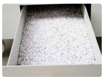
Large waste tray which can be easily removed from the front.