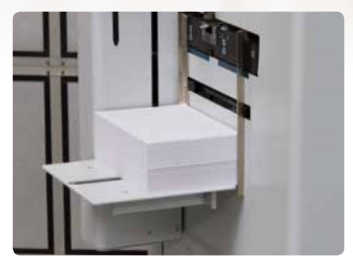
Deep pile feeder with high prestack capacity up to 4.000 sheets.