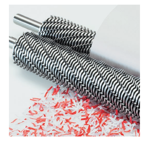
SOLID STEEL CUTTING SHAFTS

Robust and durable: high-quality paper clip proof cutting shafts with lifetime guarantee under conditions of fair wear and tear.